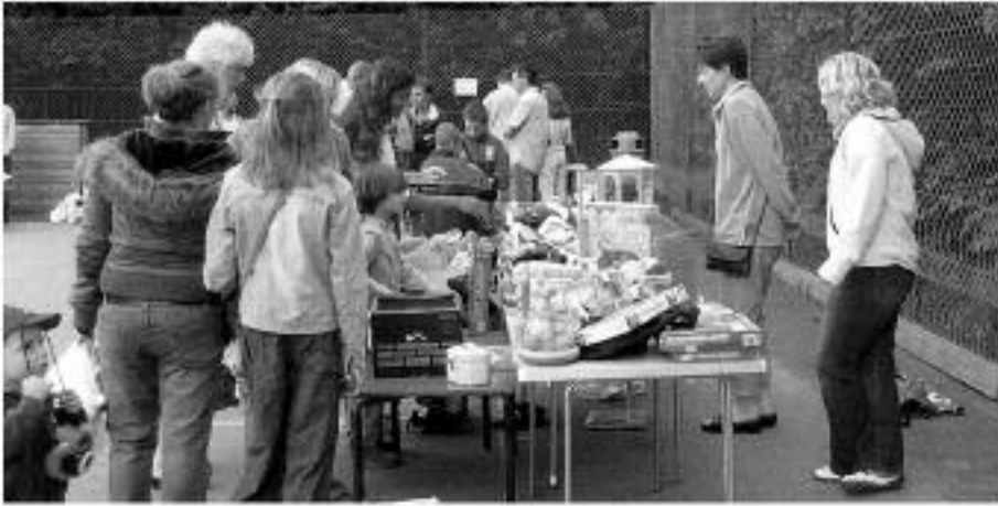
One of the stalls at the Summer Fete

As the second year of my Headship at Brixworth CEVC Primary draws to a close there is time to reflect on the academic year 2004/2005.